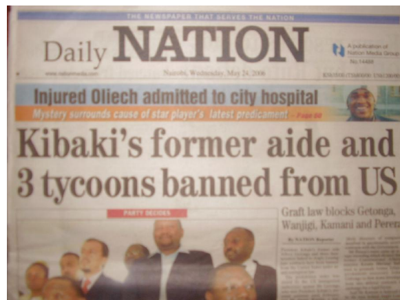
Insecurity Is Rife